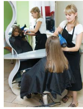
Convenience Stores / Salons