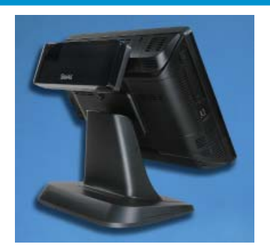
Optional Integrated VFD Customer Display