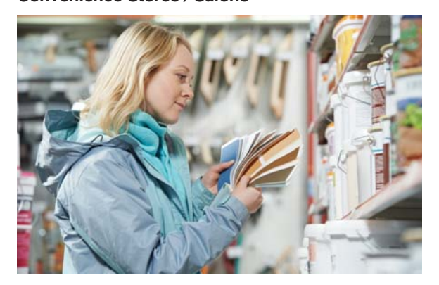
Hardware, Paint or General Retail Stores