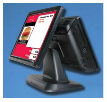
Optional Integrated 15" Rear LCD Customer Display