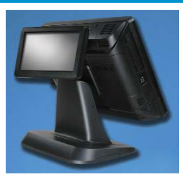
Optional Integrated 7" Rear LCD Customer Display