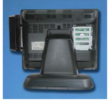
Tool-Free Access to Hard Disk Drive Optimizes Serviceability