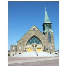
Saint Augustine's 340 Dominion Street Moncton, NB