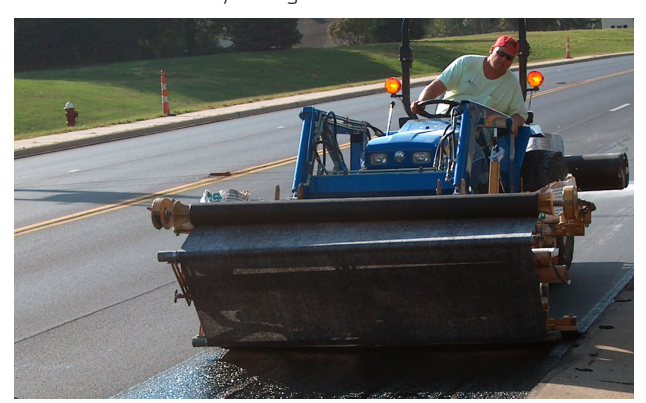
The GlasPave 50 wide-width rolls allow faster installation that can result in a savings on labor costs.

THE CHALLENGE: Due to reflective cracking, concrete streets with asphalt overlays tend to have a short service life, 10 years or less, and expensive pavement maintenance afterwards. The challenge was to increase the life cycle of resurfaced streets and decrease the maintenance costs by reducing the number of joint repairs, reinforcing the resurfaced asphalt and waterproofing the pavement. The City of Westlake's 20-foot wide concrete streets featured centerline and transverse joints every 25 feet that were randomly failing.