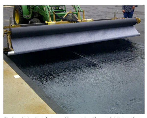
GlasPave Paving Mats feature a thinner yet durable material that requires less tack coat during the installation process than other paving mats. Often times, the amount of required tack coat can be reduced by half!

THE GLASPAVE ADVANTAGE: The fiberglass matrix in a GlasPave paving mat provides significantly greater tensile strength at low strain when compared to conventional paving fabrics and other paving mats. This helps extend pavement life, even in the harshest environments, by delaying reflective cracking, which is a common contributor to costly repairs and the eventual failure of asphalt overlay applications. Also, the non-woven matrix structure of GlasPave allows for an asphalt binder to penetrate and fill voids within the fabric to limit moisture infiltration into the pavement. The distinctive design facilitates a quick and strong bond with a variety of tack coats.