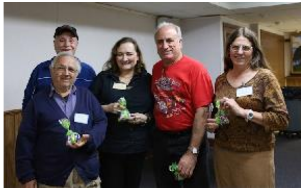
Happy Birthday and welcome!