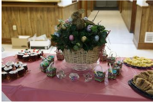
The pretty refreshment table centerpiece and yummy things to eat.