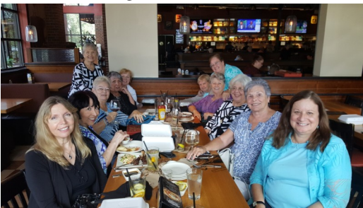
Chick Flicks group dining at BJ's Restaurant and Brewhouse July 25