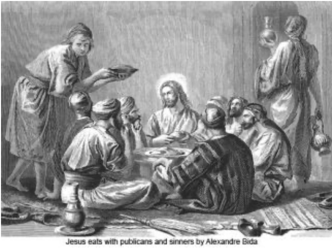
Jesus eats with publicans and sinners by Alexandre Bida