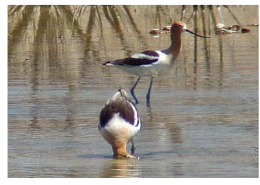
American Avocets at Keystone

At Keystone Heritage Park we will have a booth with pictures of the birds of Keystone, chapter handouts, scopes set up to view the birds on the water and those wading around the edge. Probable good looks at Pied-billed Grebe, Mexican Mallards, Cinnamon Teal and Buffleheads . Also Black-necked Stilts, American Avocets, Greater Yellowlegs, Least Sandpiper and Long-billed Dowitch ers. The large contingent of Ring-billed Gulls will probably drop in and could be accompanied by a rare one.