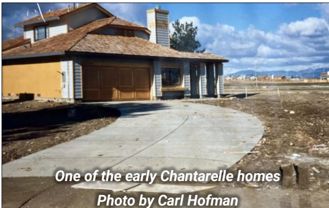
One of the early Chantarelle homes

There are 120 homes in our community. The homes were built between 1988 -1990. The original plan was to have a golf course built within the community, thus the addition of a garage extension that was supposed to house a golf cart. (I'm actually sitting where the golf cart would have gone. I've made it into a small office for myself right off the kitchen. It was a nice surprise when my husband and I bought the house. I had never heard of Chantarelle and thought its name came from the shape of the community looking a bit like a mushroom.)