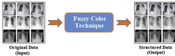
Figure 2 Sub-data sample of the original dataset obtained by the Fuzzy Color technique [28]

Fine-Tuning is another approach that is widely being used. The CNN, VGG16, VGG19, DenseNet201, Inception ResNet V2, Inception V3, Xception, Resnet50, and MobileNet V2 designs have their top layers fine-tuned [27]. Each pixel in the image has a membership degree to each window in the fuzzy color technique. The weights of each blurred window are averaged to get the final image.