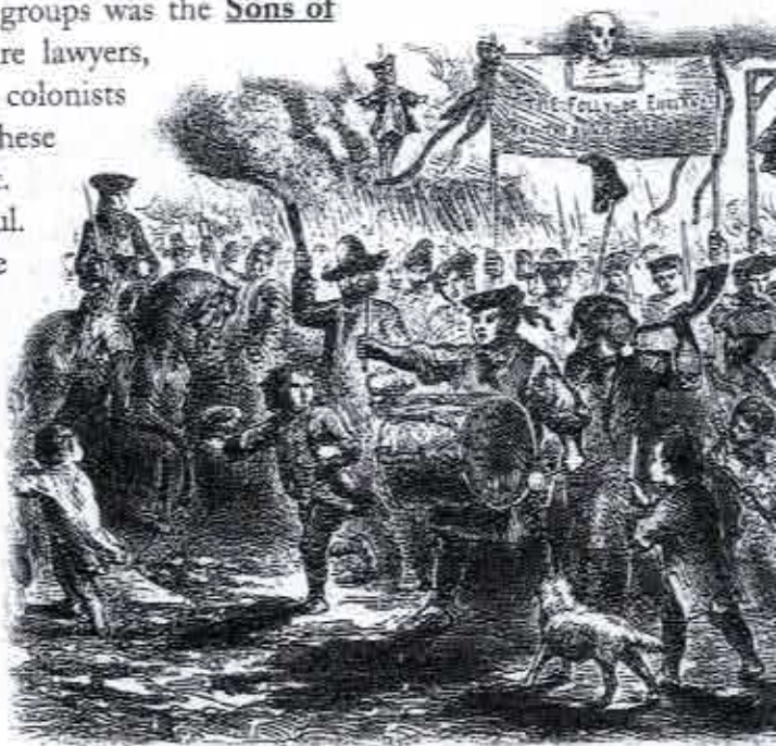
Colonists protest the Stamp Act.

Background To voice their protests, the Sons of Liberty in Boston met under a huge, 120-year-old elm tree that they called the Liberty Tree.