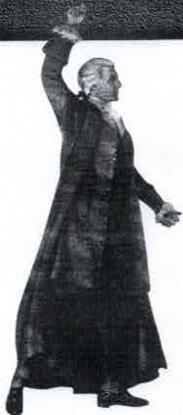
James Otis, Jr., argues in court against illegal search warrants in 1761.

In making the first public speech demanding English liberties for the colonists, James Otis planted a seed of freedom. In this section, you will read more about the early protests against Britain's policies in America.