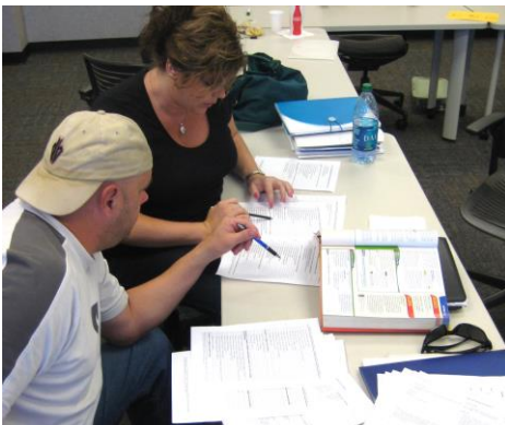
Teachers love the collaboration and prep time!

REGISTRATION: The first institute quickly sold out, so we've created this 2nd institute June 19-22. COMPLETE AND SUBMIT REGISTRATION FORM BELOW.