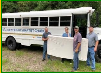
Donated mattresses delivered by New Heights Baptist Church, Ft. Wayne, IN.