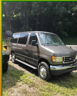
Van donated by Lighthouse Baptist Church, Newark, NY.