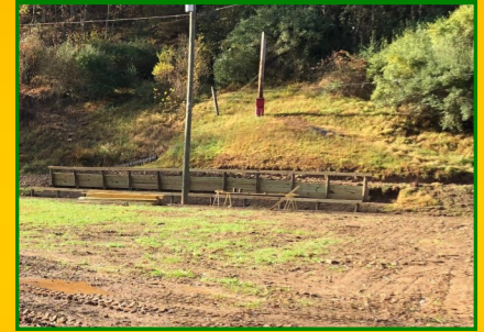
Installing stairs, railing, & walkway for the bleachers on the hillside.