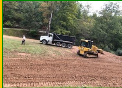
Dozer working to crown ballfield.