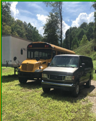
Sold old buses to purchase a newer one.