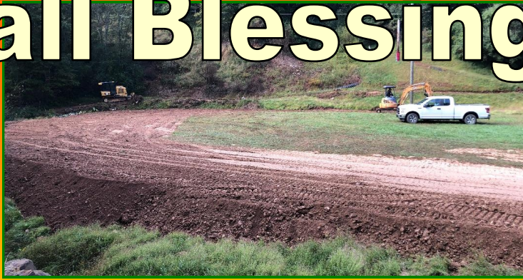
Enlarging the Wolf Pen Recreational Area ballfield.