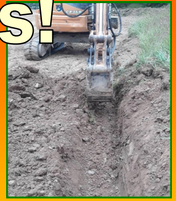
Repairing drainage ditch beside the ballfield.