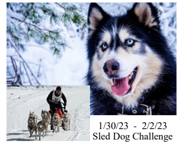
1/30/23 - 2/2/23 Sled Dog Challenge