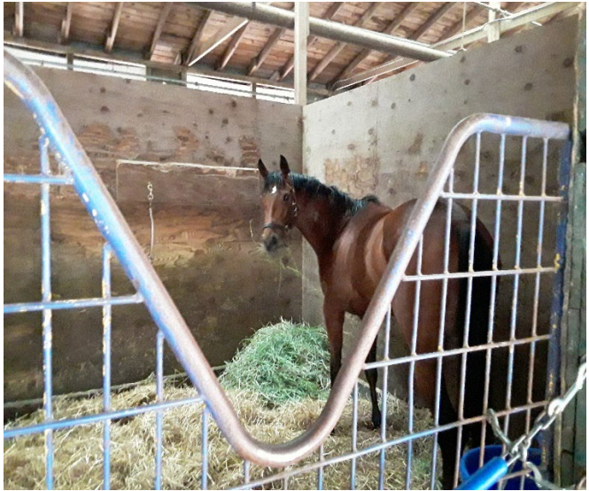
True Prosperity in her stall after the race.