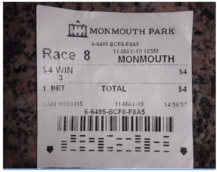
Winning ticket