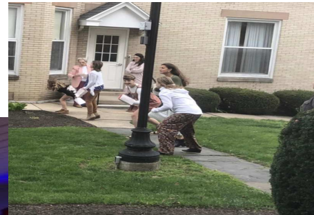
Easter Egg Hunt