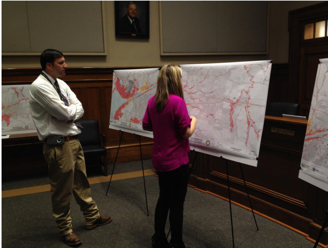
Figure F-6. Photos of the November 2015 Community Meeting