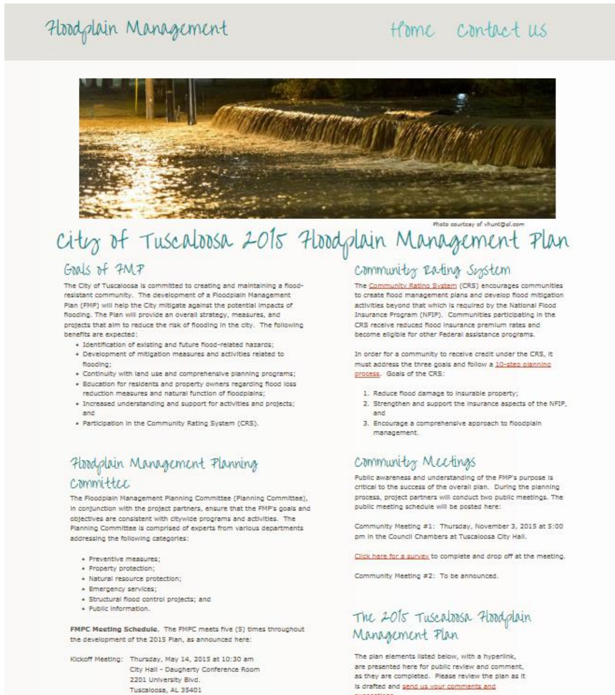
Figure F-1. Portion of Website at tuscaloosa.floodplainmanagementplan.com