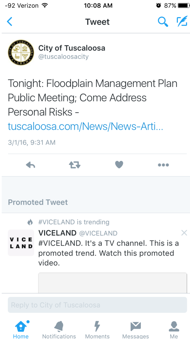
Figure F-8. Twitter Feed Image Announcing the March 2016 Community Meeting