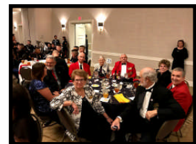
One of our Detachment Tables