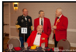
Slay Marines looking sharp.