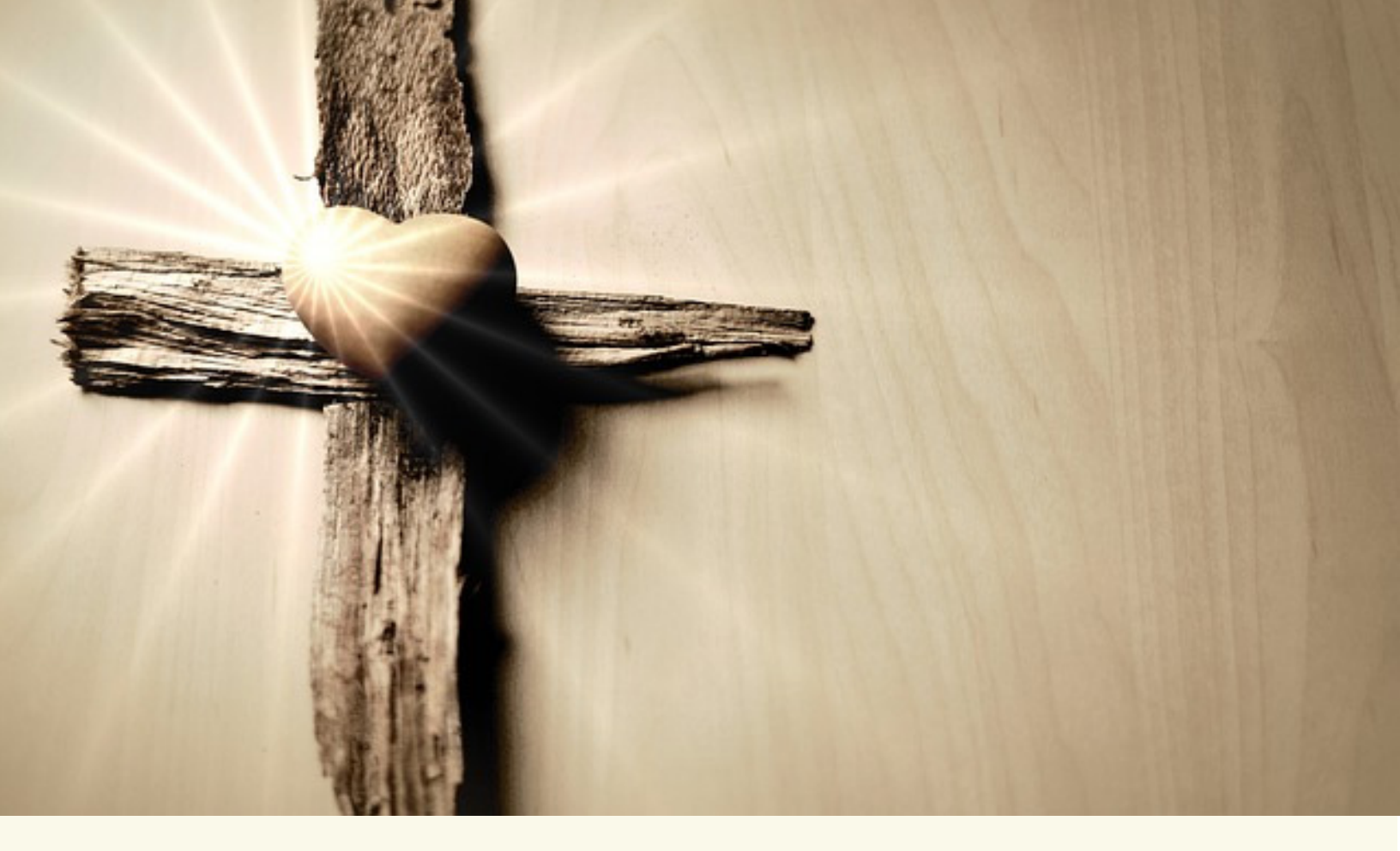
The Lutheran Church—Missouri Synod LCMS Stewardship Ministry Newsletter Article