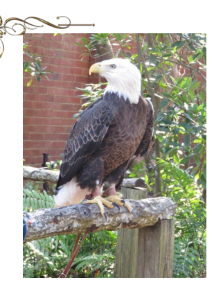
An eagle on its perch