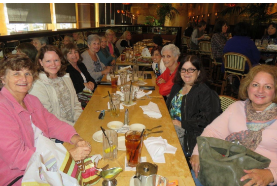
Sixteen Newcomers and guests gathered for lunch at Cheesecake Factory in Winter Park after the tour.