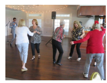
Luncheon attendees showed off their dance moves.