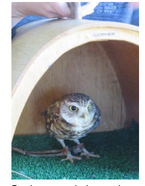
Gopher, a male burrowing owl with a fractured wing joint, greeted visitors.