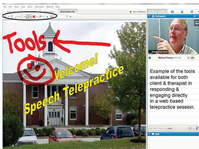
Figure 2: A screen shot of web-based telepractice that features authentic materials and an array of therapist/client response tools.

A web-based model allows both the therapist and client to work in online programs in a true digital learning environment (Christensen, Johnson, & Horn, 2008). Therapy sessions can be recorded, edited, saved and later viewed online by the client, caregivers, family members and/or teachers who are granted access to the materials. The client can go online multiple times to access the therapy program for additional practice and learning. The therapist has the ability to monitor the client's responses to virtual therapeutic materials as often as desired before the next scheduled treatment session.