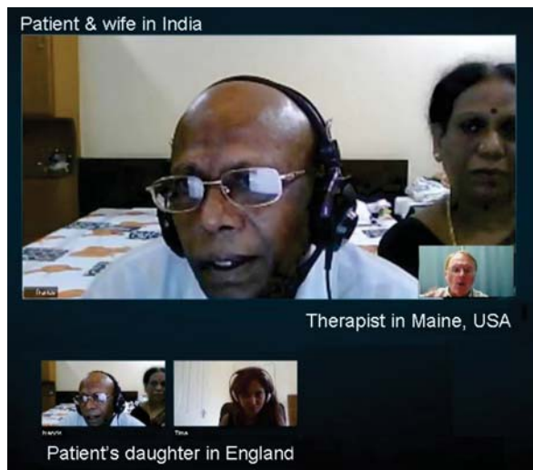
Figure 3: Connecting from Maine USA to India, more than 11493 kilometers away (7143 miles), with secure high definition web-based speech therapy telepractice on personal computers using no special hardware or software.