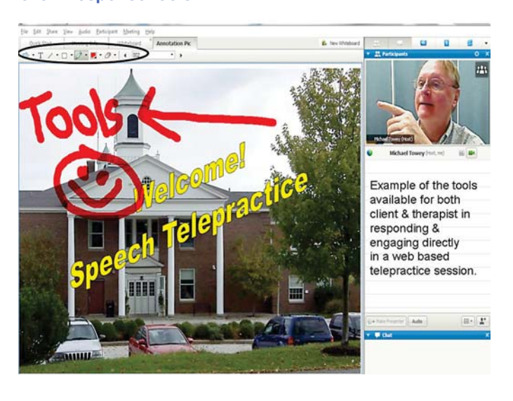
Figure 2: A screen shot of web-based telepractice that features authentic materials and an array of therapist/client response tools.

A web-based model allows both the therapist and client to work in online programs in a true digital learning environment (Christensen, Johnson, & Horn, 2008). Therapy sessions can be recorded, edited, saved and later viewed online by the client, caregivers, family members and/or teachers who are granted access to the materials. The client can go online multiple times to access the therapy program for additional practice and learning. The therapist has the ability to monitor the client's responses to virtual therapeutic materials as often as desired before the next scheduled treatment session.