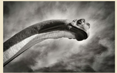
Pete Holland 3rd Place with "Dinosaur Valley"