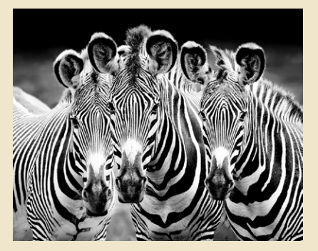
Photograph of the Year "Looking at You" Leslie Ege