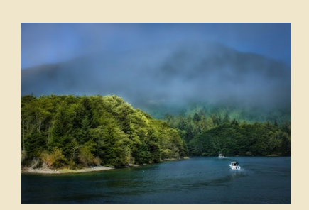
Rose Epps 2nd Place with "Into the Fog"