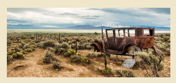
Ken Uplinger 2nd Place with "Busted in Nevada"