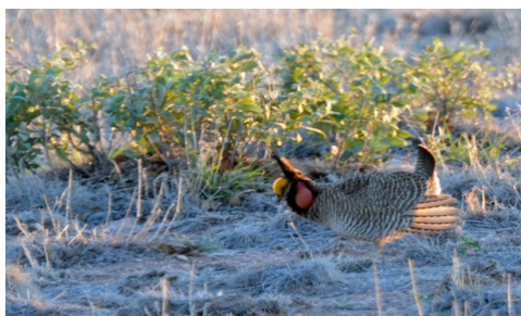
Lesser Prairie-Chicken

Other highlights were Scissor-tailed Flycatchers, Swainson's Hawk on nest, Golden Eagle, Prairie and Peregrine falcons, Osprey eating a fish on the Pecos River, Franklin's Gulls and Western Bluebirds.