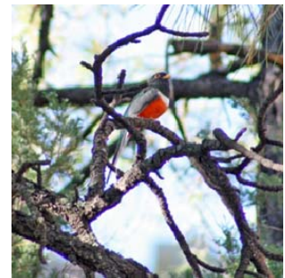
Elegant Trogon