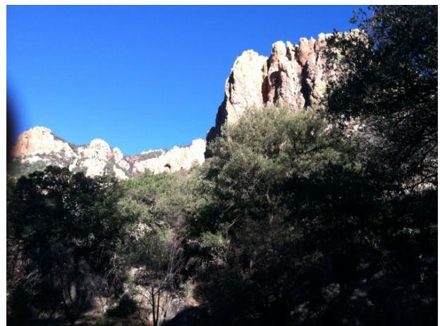
Chiricahua Mtns