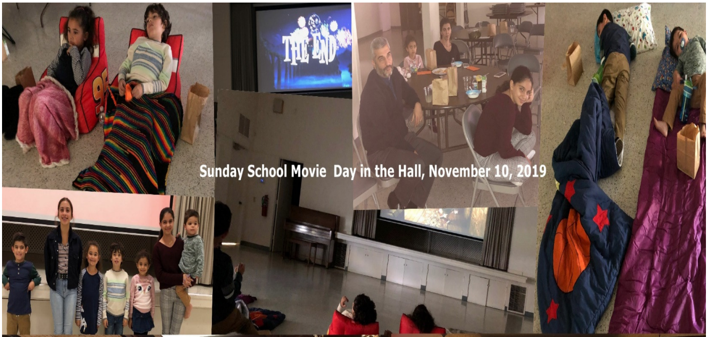
Sunday School Movie Day in the Hall, November 10, 2019