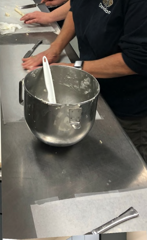
Ladies Society Cooking Class.