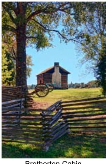
Brotherton Cabin, Chickamauga Battlefield - 27 Rose Epps