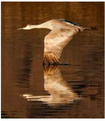
Flying Low - Sandhill Crane - 27 Paul Munch