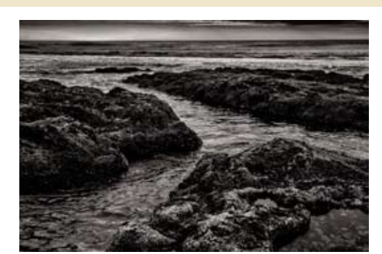
Rising Tide - 27 Dolph McCranie