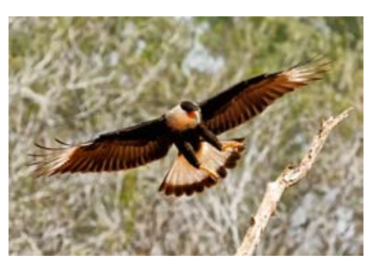
Caracara Landing - 27 Brian Loflin