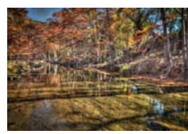
Autumn on the Guadelupe - 24