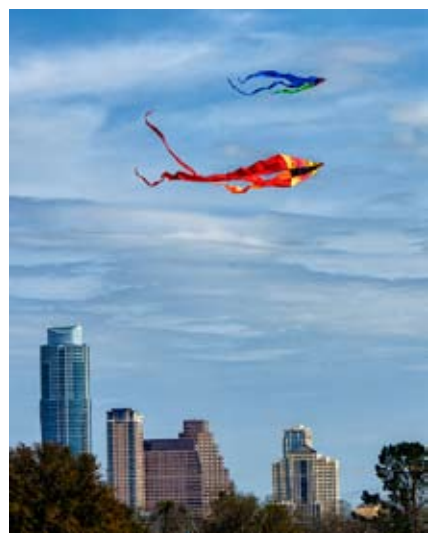
Kites Over Austin - 27 Linda Sheppard