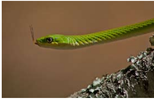
Smiling Snake - 27 Laura Singleton