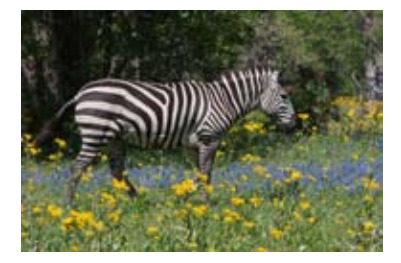
Zebra Enjoying the Texas Wild Flowers - 21