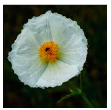
White Poppy Thistle - 27 Linda Sheppard