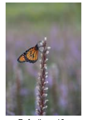
Refueling - 18 Jeff Singleton