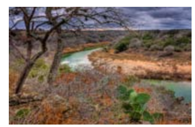
The Pedernales at Rimers Ranch - 23 Pete Holland