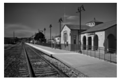
Alpine Station - 23 Tom Delaney