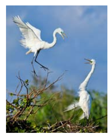
Great Herons Nesting - 27 Leslie Ege