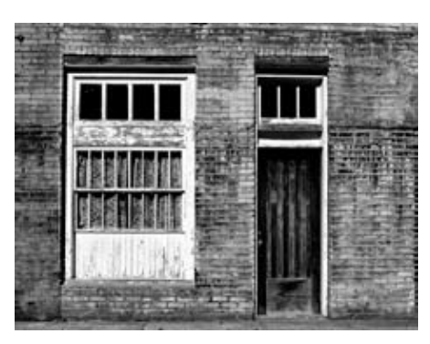
Lace Curtains - 26 Paul Munch