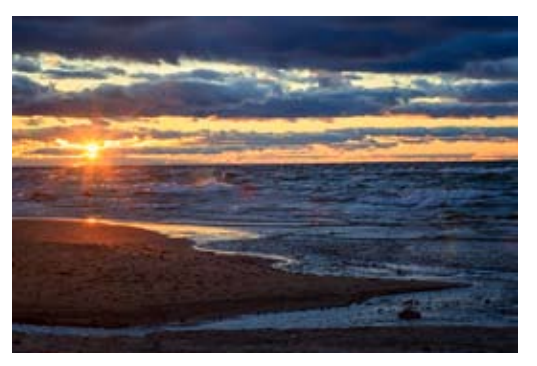
Lake Superior Sunset - 27 Rose Epps