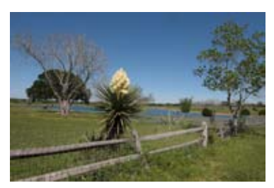
Yucca Plant at Chappell Hill Ranch