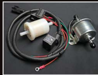
Raptair Remote Fuel Priming Pump 12V diesel fuel priming pump to tie into a remote fuel tank