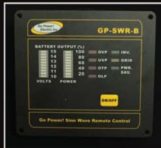
Inverter Remote Kit Remote panel for the Inverter