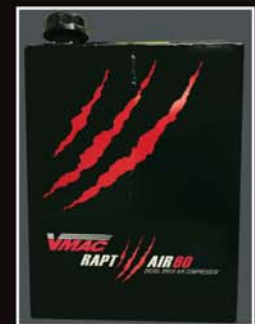
Raptair Fuel Tank 7 gallon fuel tank option to be attached directly to the back of the Raptair