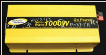
12V DC to 120V AC 1000W Pure Sine Wave Inverter Designed to power your Raptair with cold climate kit