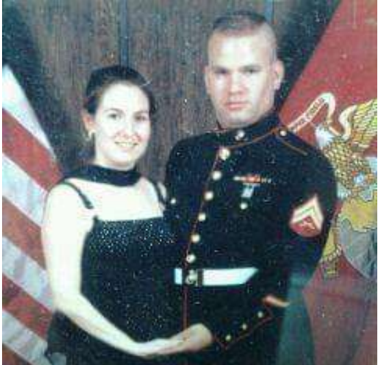
My Wife and I at the Marine Corp Birthday Ball 2001. I was the Rank of Corporal.

The Website is www.macombmarines.com or on Facebook visit Macomb County Detachment, Marine Corp League.