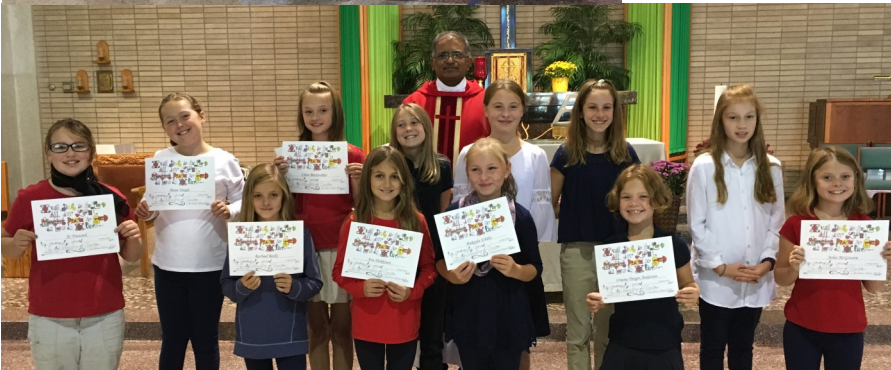
Our 4th and 5th Graders were commissioned as cantors for school Mass.