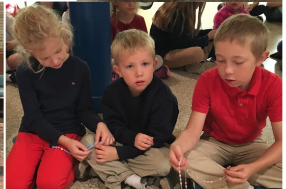
The older children guide their younger friends in praying the rosary at morning prayer.