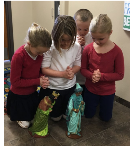
First graders paused for a quiet moment when the Wisemen journeyed through our halls on their way to the stable.