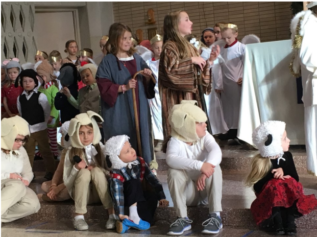
Students presented the play "Room for Christmas" in December.

The cornerstone of a St. Mary's School education is our focus on Faith. Students begin and end each day with all-school prayer, attend Mass weekly, and participate in liturgical roles. Our Faith in God carries us through each day.