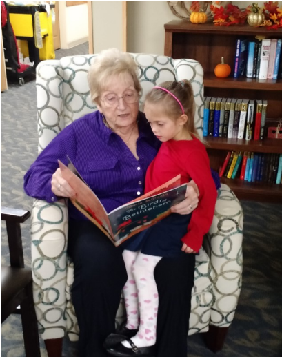
Every Tuesday our students visit Milestones Senior Living for our Reading Buddies Program.

Learning about our faith is important. At St. Mary's School we teach our students to go one step further and serve. We must use the gifts we are blessed with to help others.