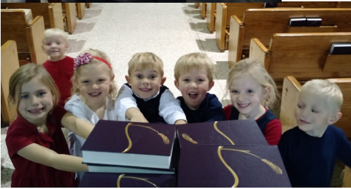
The 4 year old Kindergarten served by distributing the new hymnals.