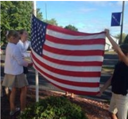
Students take turns raising and lowering the flag each day.