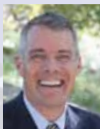
PETE PETERSON Secretary of State