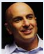
NEEL KASHKARI Governor

OFFICIALLY Featuring Every Statewide Candidate and Proposition Endorsed by California Republican Taxpayers' Association