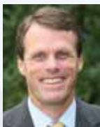
TED GAINES Insurance Commissioner