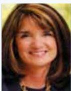
DIANE HARKEY* State Board of Equalization, 4th Dist.