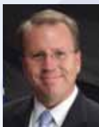
RON NEHRING Lt. Governor