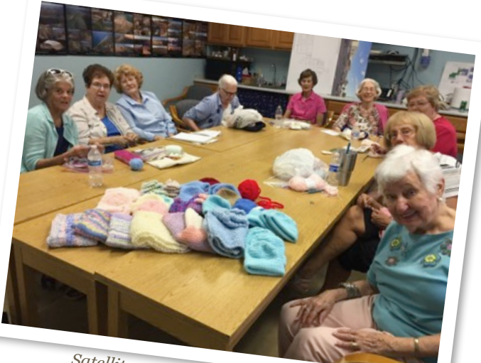
Satellite members from St. Thomas

Meet more satellites in our next newsletter!