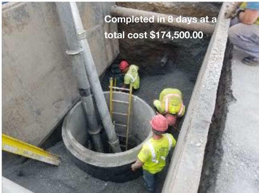
Completed in 8 days at a total cost $174,500.00