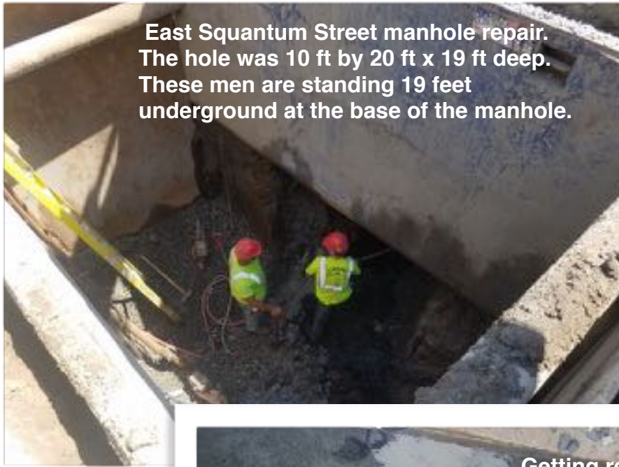
East Quantum Street manhole repair. The hole was 10 ft by 20 ft x 19 ft deep. These men are standing 19 feet underground at the base of the manhole.