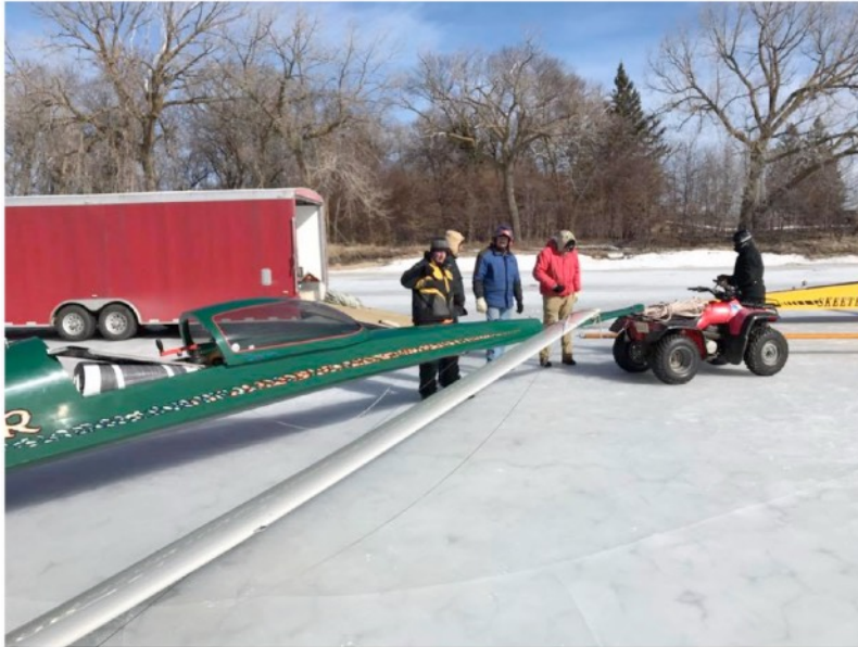
"Sail and boom in cockpit and mast lashed to springboard and plank for tow back to pits."

The ISA and Renegade Championships called on for Battle Lake, Minnesota February 24-26, 2017