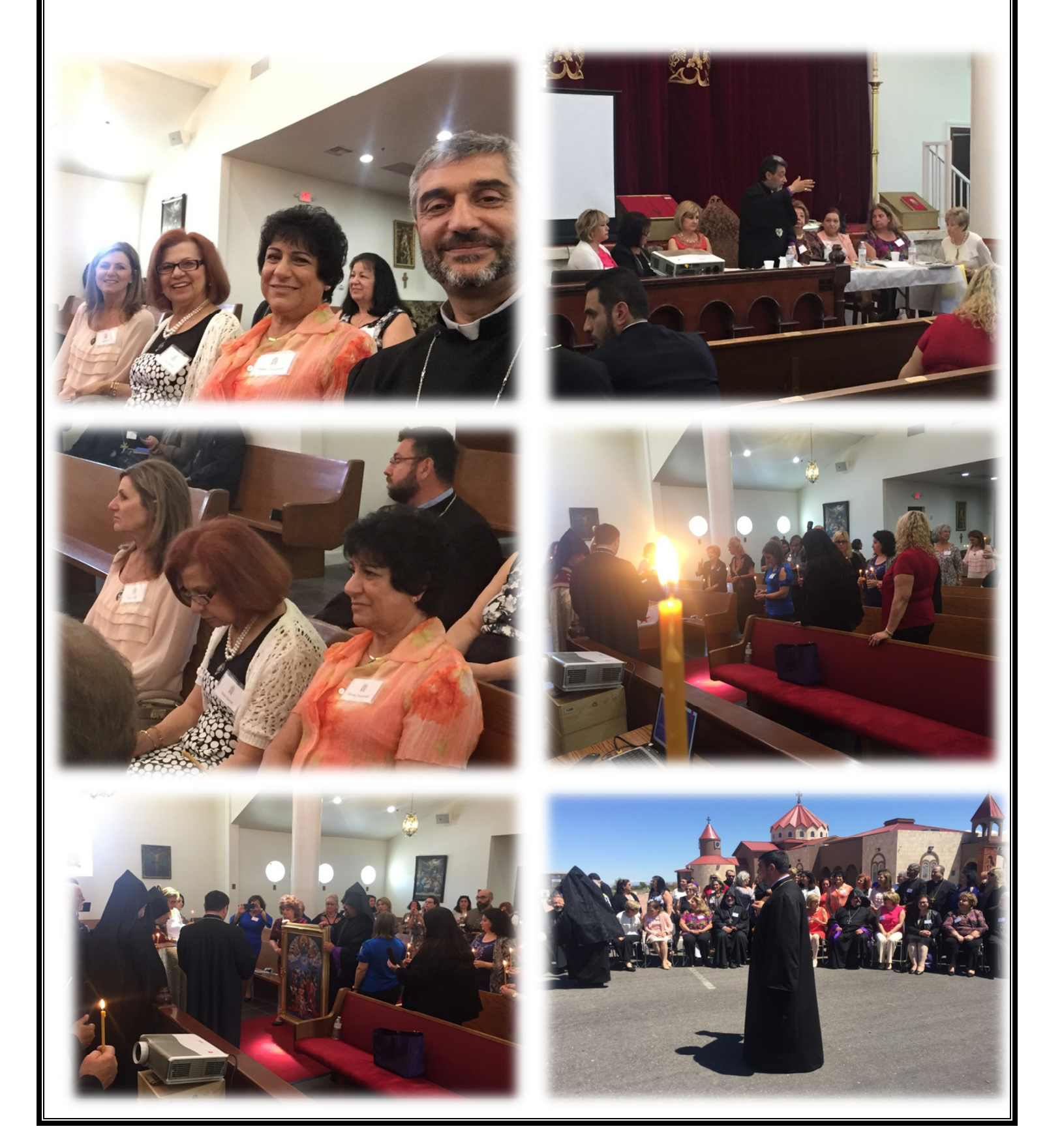
<u>Western Diocese of the Armenian Church</u> <u>On May 3<sup>rd</sup> & 4<sup>th</sup> 2018</u> <u>91<sup>st</sup> Annual Assembly Meeting was held in Las Vegas at St. Geragos Armenian Church</u>