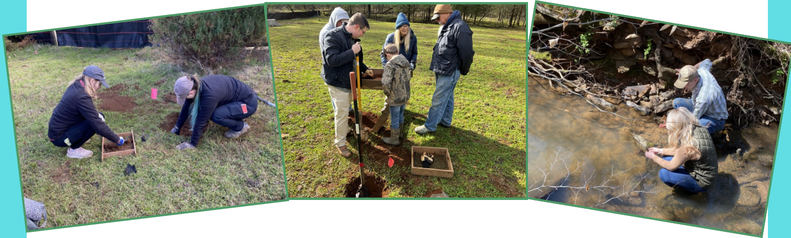
Volunteers enjoying the cool weather while searching for artifacts

In March Gwinnett Archaeological Research Society facilitated a community-led archaeology fieldwork day at Poole Mountain for a private landowner. The community came together to complete a shovel testing, metal detecting, and surface collection survey that resulted in the identification of a multi-component site! They found Native American stone artifacts, above-ground features associated with a historic tub mill, and historic ceramics.