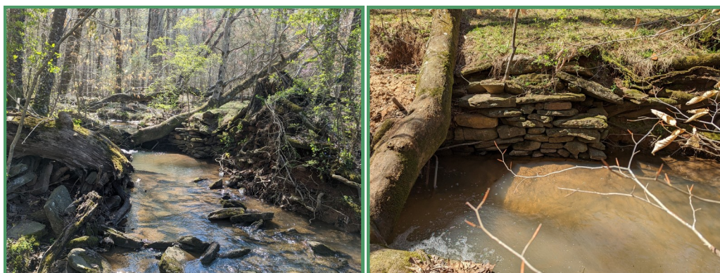
Historic Features at the Poole Mountain Site