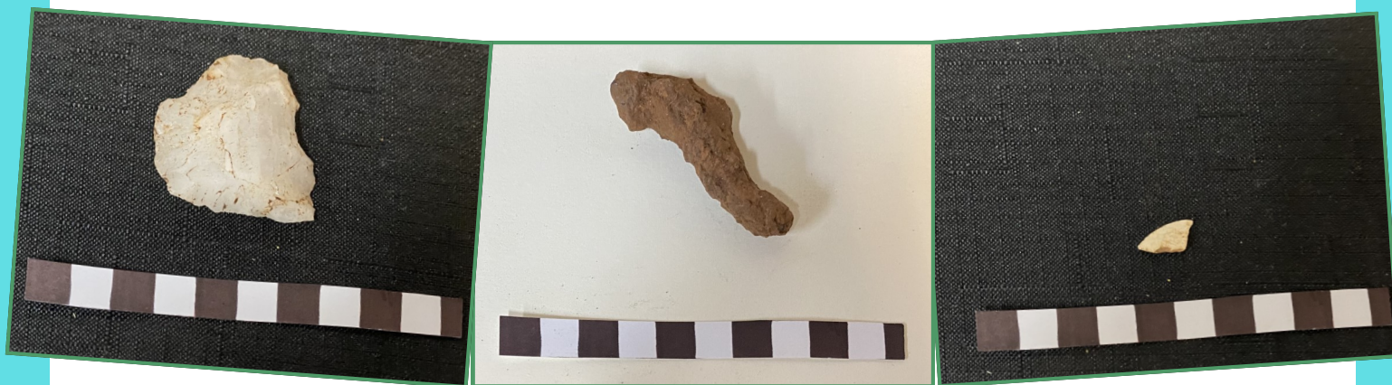
Artifacts found at the Poole Mountain site ( from left to right ): Lithic biface fragment, Metal fragment, and Creamware fragment