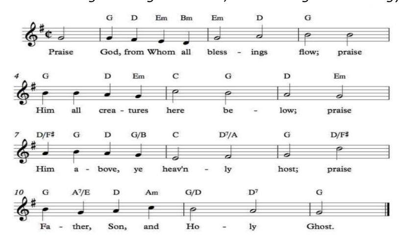
Doxology, written in England for Protestant Churches in 1674.

As the offering is brought forward, we will sing the Doxology.