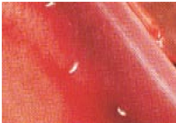
Figure 2: Early larval instars on nasal mucosa

Like other flies, the sheep bot fly has four stages: egg, larva, pupa, and adult. Because the egg stage hatches within the female fly, it is not seen (John and Michael, 1992). The adult sheep bot fly which has a bee-like appearance is grey fly and about 10-12mm long; with small black spots on the abdomen and a covering of short brown hairs. The head is broad with small eyes. The segment of the antennae is small. The mouthparts are reduced to small knobs and non-functional and do not feed. The larvae are broadly cylindrical or barrel-shaped, narrowing at their extremities when they are mature. The body-wall is very tough with lateral swelling and a group of spinules in twelve segments are present. The first two are much reduced and annular thus larvae, in close contact with mucosa, play an essential role in accumulating nutrients for the free stages of the life cycle (Widad, 2010). The females are short lived, about two weeks, but during this time each can deposit up to 500 larvae (L1) in the nasal passages of sheep and goats Adult females do not lay eggs directly on the host. Instead, fertile eggs hatch within the female fly, and she deposits up to 25 newly hatched larvae at a time in the nostrils of the host during flight (first stage larvae). Larvae pass through three stages or instars: first (L1), second (L2) and third (L3) instars, of increasing size (Basaznew, 2007).