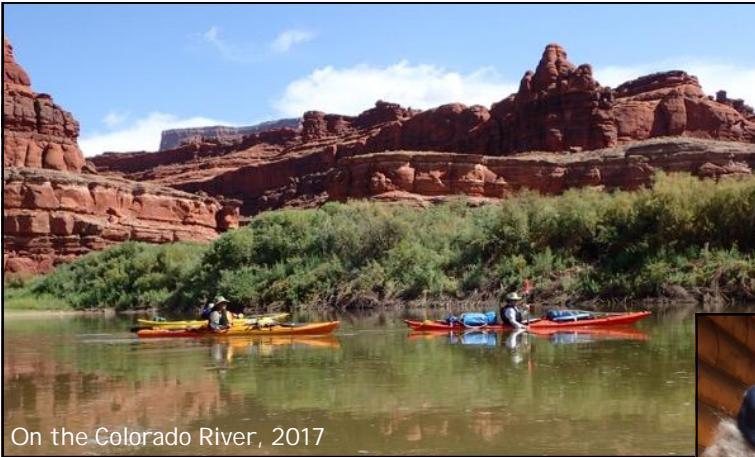
On the Colorado River, 2017