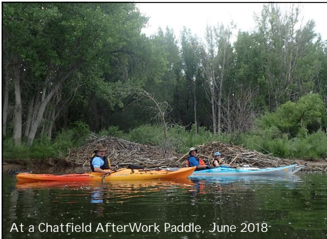
At a Chatfield AfterWork Paddle, June 2018