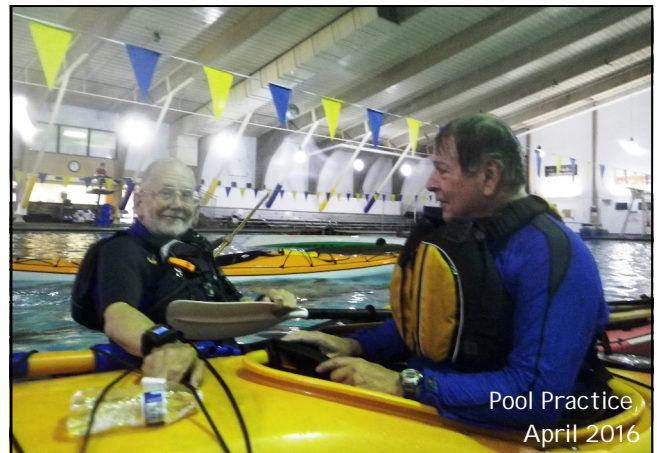
Pool Practice, April 2016