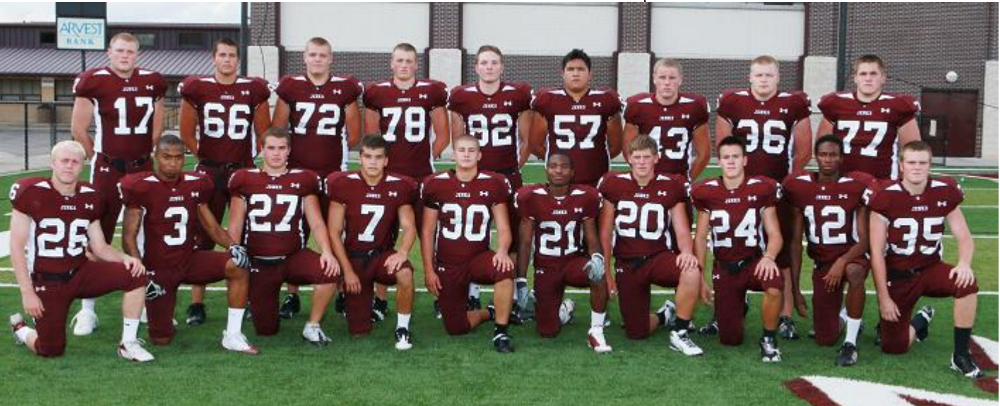
2009 Seniors - 2008 Seniors - 2007 Seniors - 2006 Seniors

Scroll down to view individual Senior profiles