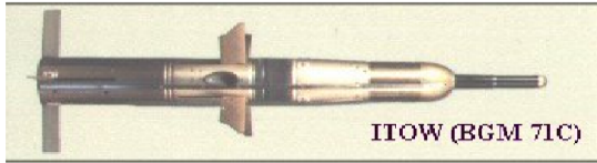
I-TOW (BGM 71C)