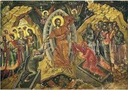
This Icon shows Christ's Victory over Death.

Green is the colour of the living earth and has been used to portray youth, hope and where life begins. This is in contrast to brown which is meant to indicate our fallen nature on earth and that we will all eventually become dust.