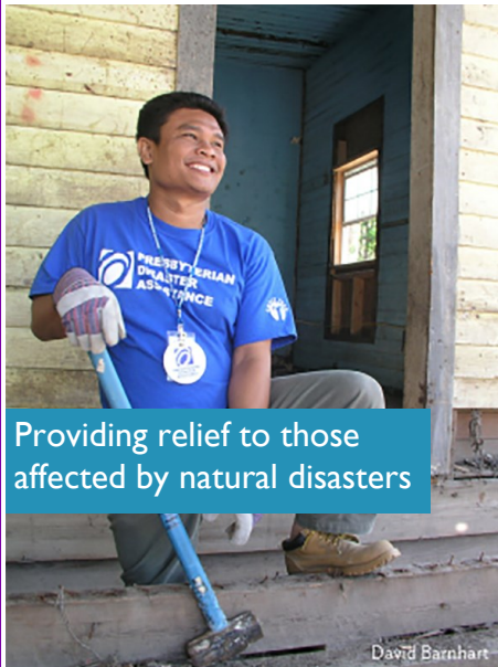
Providing relief to those affected by natural disasters