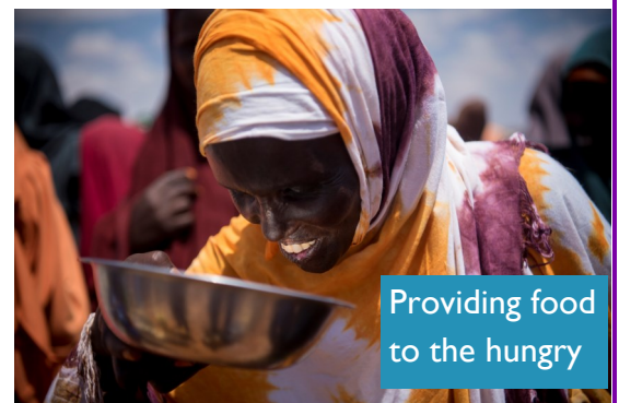
Providing food to the hungry