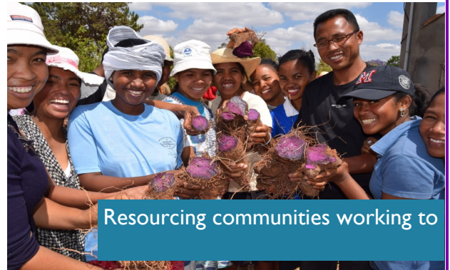
Resourcing communities working to