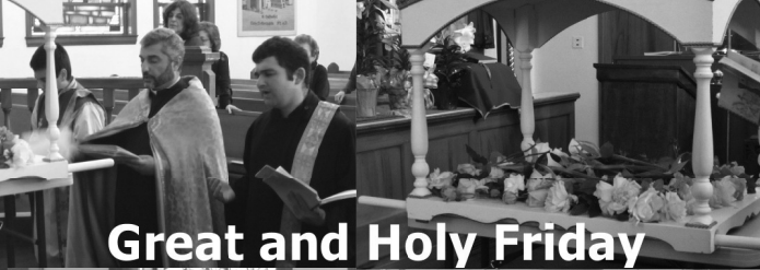
Great and Holy Friday