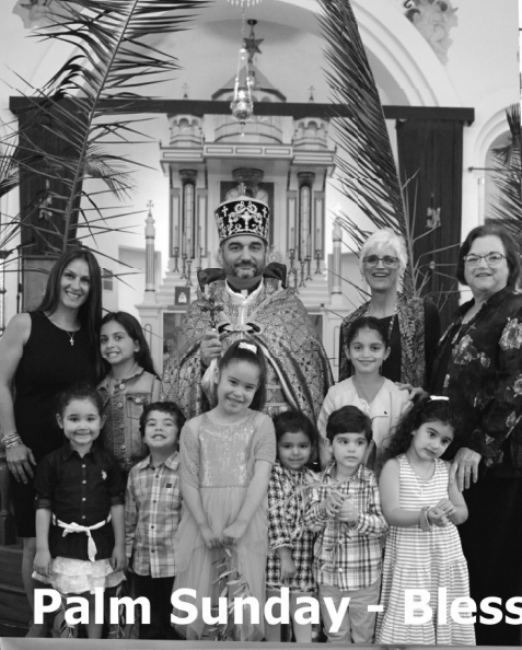
Palm Sunday - Blessing of the Children