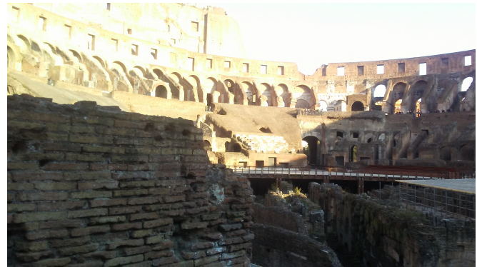
THE COLOSSEUM ON A SUNNY DAY

Our first stop was the Forum. The arch of Septimius Severus captured our attention almost immediately. We