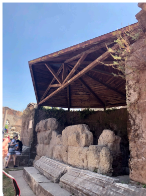
THE TEMPLE OF CAESAR

Inside the Forum, the Temple of Caesar is among the less preserved. While it is perhaps underwhelming to the eye at first glance, it can be appreciated once its history is understood. At first glance, the Temple of Caesar, or more accurately, the ruins of the Temple of Caesar, seem to be an ancient altar surrounded by rough stone. In comparison to other structures such as the