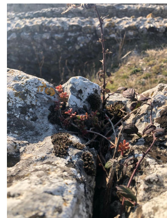
A PERSISTENT PLANT AT NARNI

This wouldn't be an article about Rome and Italy without a short tangent on sewers and aqueducts. In the town of Narni — known as Narnia in Latin — we walked into an aqueduct tunnel and even learned how the Romans used technology to build aqueducts through mountains and fields alike. In Todi, we traveled through a reservoir built right under the city square! The small,