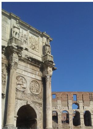
THE ARCH OF CONSTANTINE