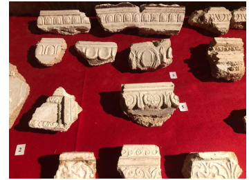
MARBLE PILLAR PIECES AT CASA ROMANA

Almost under our feet were the very mosaics that decorated the floor some rich Roman family owned years ago — the detail in the geometric patterns and colors was wonderful to see for myself! I’m glad such meticulous work has lasted so long. Inside the house, we saw artifacts of everyday objects and remnants of inscriptions.