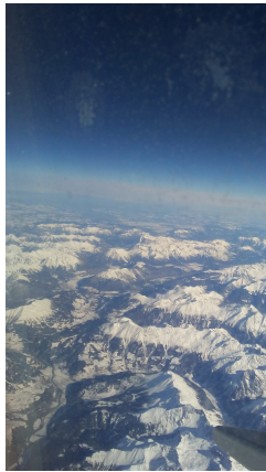
THE ALPS SEEN FROM OUR FLIGHT