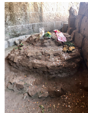
FLOWERS AT THE TEMPLE

“Ultimately, it is amazing to see a location that has preserved its meaning to the present day, even if its physical composition has not been so fortunate.”