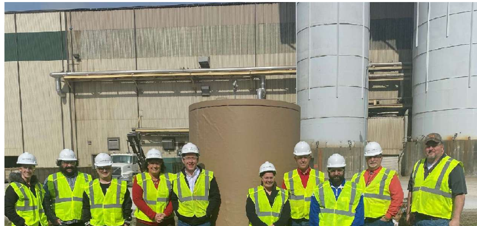
INTERNATIONAL PAPER TOUR, FEB. 20, 2020