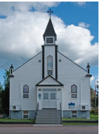
Our Lady of Mercy 11 St. Andrews Street Pointe-du-Chêne, NB E4P 5E4