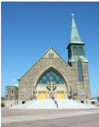
Saint Augustine's 340 Dominion Street Moncton, NB E1C 6H8

November 3rd, 2019 Thirty-First Sunday in Ordinary time