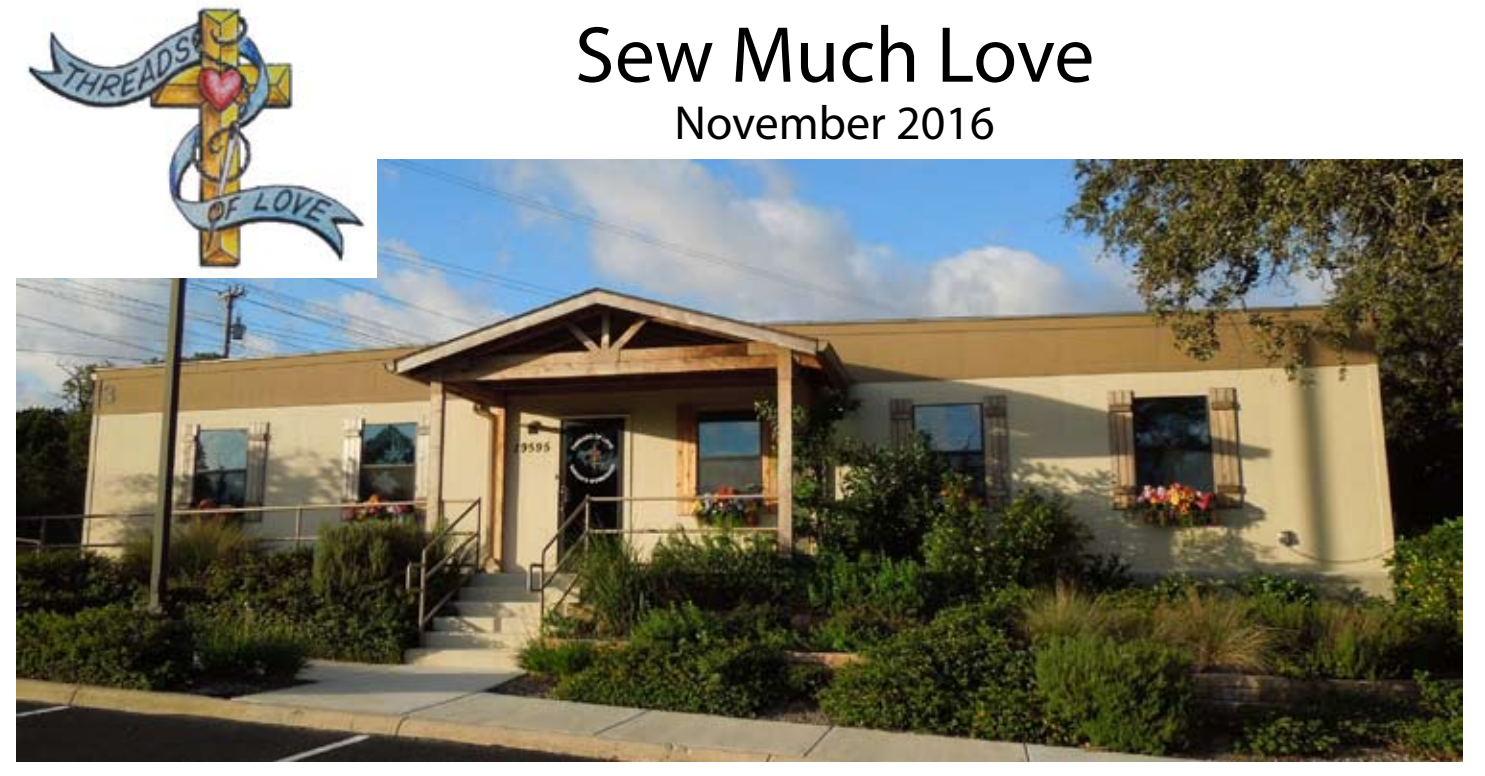
"I tell you the truth, whatever you did for one of the least of these brothers of mine, you did for me." Matthew 25:40