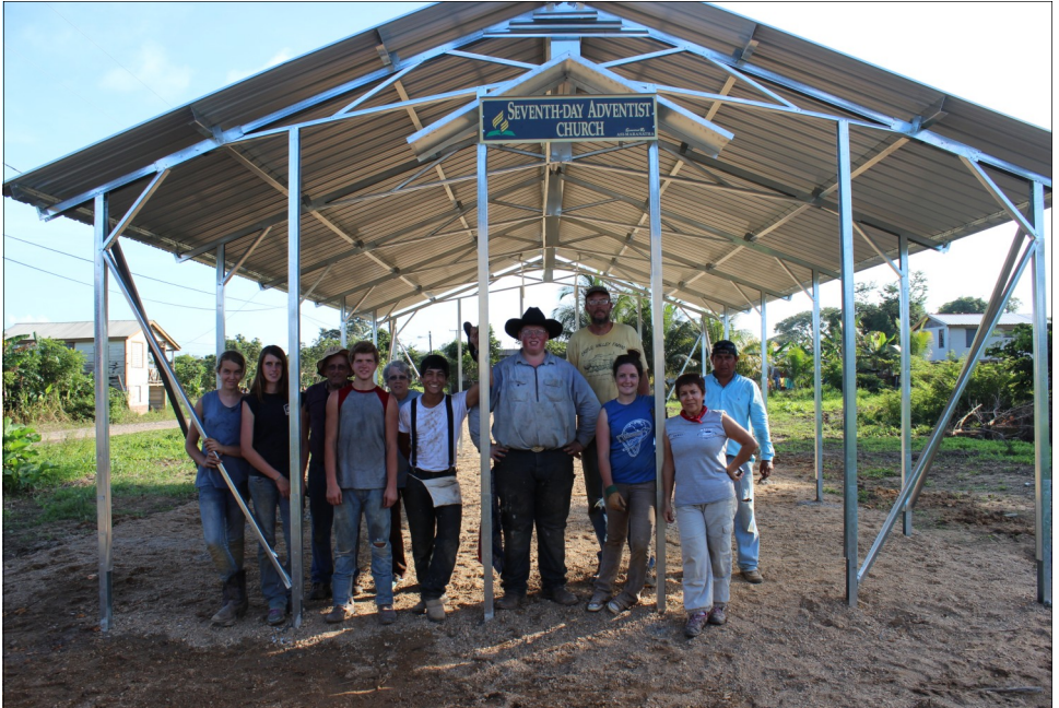
One-Day Churches in Belize Story pg 6