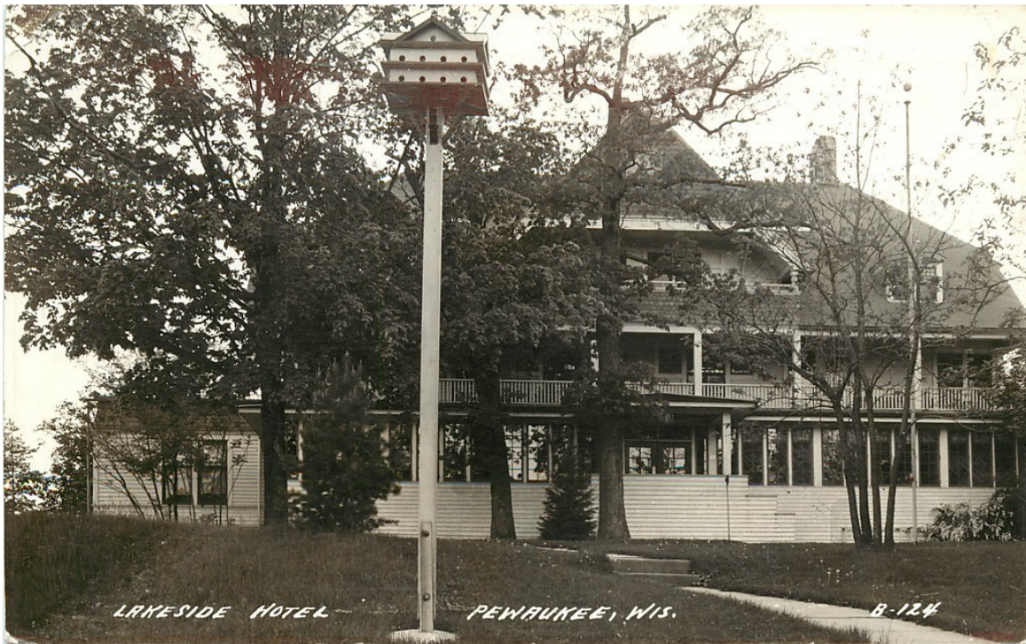
Lakeside Hotel Pewaukee WI