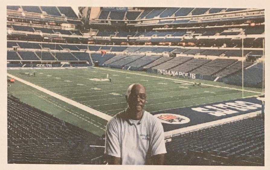
Hill at Lucas Oil Stadium in Indianapolis, where he's been involved in AV systems work.

That opportunity not only locked in five years of consistent work, it enabled