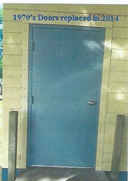
1970's Doors replaced in 2014