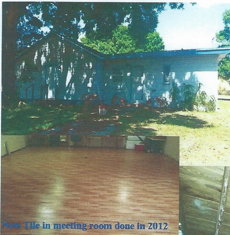
New Tile in meeting room done in 2012

Originally built in the 1950's, the building at 2505 Atlantic Avenue has seen it fair share of history, as it was the home of the Fraternal Order of Police for nearly 30 years, before they relocated, and it was taken over by the Police Benevolent Association. Unfortunately, due to lack of funding, the building was left abandoned in the late 1990's until our association acquired the building in 2008. Some minor renovations have been made but it is still in desperate need of a full renovation to bring the wiring, plumbing, and insulation up to code. With your help we can finally have a home again.